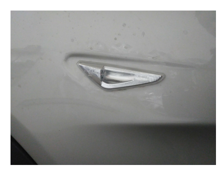
3. SIDE: Left and right side - visual damage / scratches