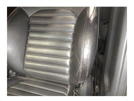
1. SEATS: All seats - condition