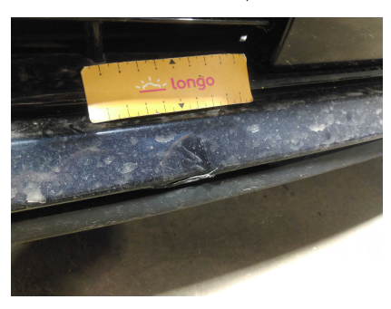
1. FRONT: Front bumper - condition and alignment