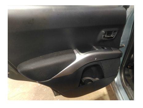
6. DOORS: Trims - condition